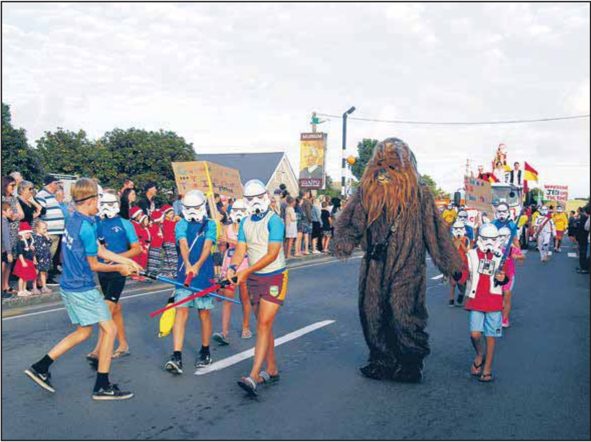
Above : The Waipu Cove Surf Lifesaving Club's Star Wars float took the first prize of $1,000 at the Waipu Christmas Eve Parade