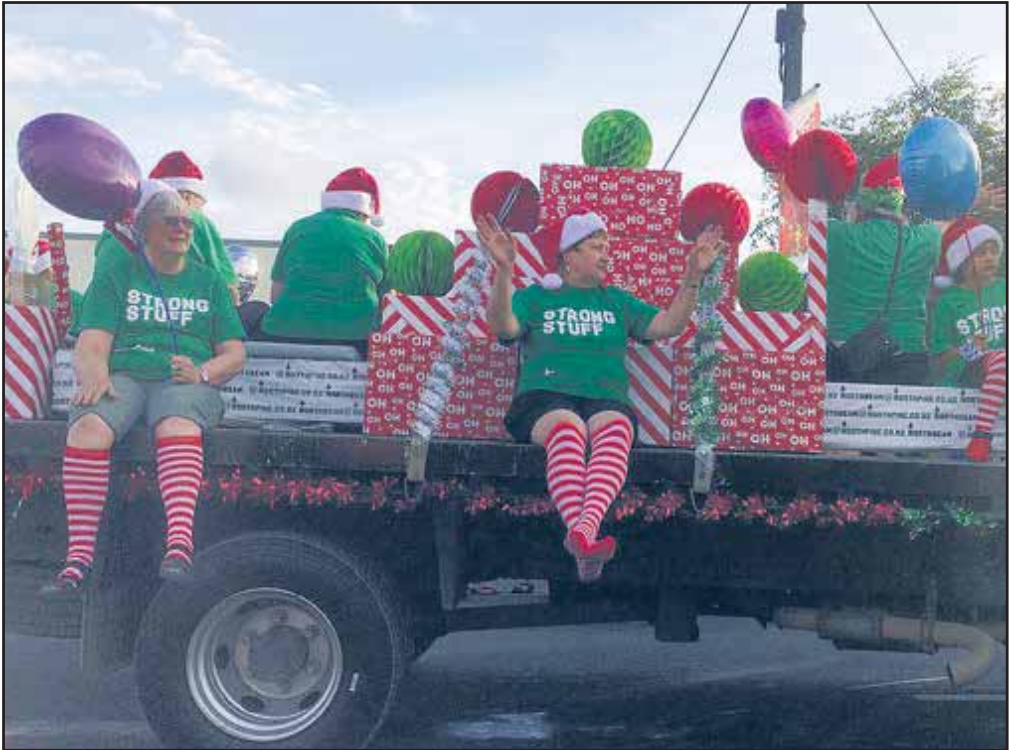
Northpine won the best business class float.

Phone the BREAM BAY NEWS - 432 0209 or email:breambaynews@xtra.co.nz if you know of something interesting going on in Bream Bay.