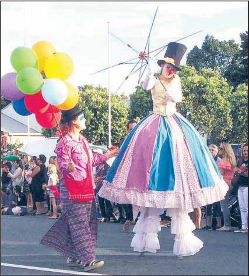
The Waipu Circool Circus took out a $200 Prize as the best Community Group entry

A $2,000 prize pool was handed out at the Waipu Christmas Eve Parade with the Waipu Surf Lifesaving Club taking the major $1,000 prize with a vast collection of storm troopers, jedis and other Star Wars characters riding or striding down the street. Other $200 prizes were won by the Northpine Float for the Best Business Entry, the Cardio Drunning Float for the Best First Time Entry and the Waipu Play Centre and Waipu Primary took runner up awards. Waipu's Circool Circus won the best community group entry prize. A large crowd turned out to watch the parade as it made its way down the street and into the Caledonian Park for a pipe band recital and prize giving.