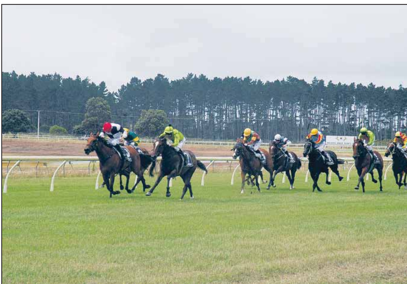
Sprinting to the finishing line in Race 5: Hatton Garden No 3 in front, followed by Walk’n By and third on the inside O’Sam.

Entertainment between races included: live music by A2Stix, a tug-o-war, sack race and the Pulse dance group.