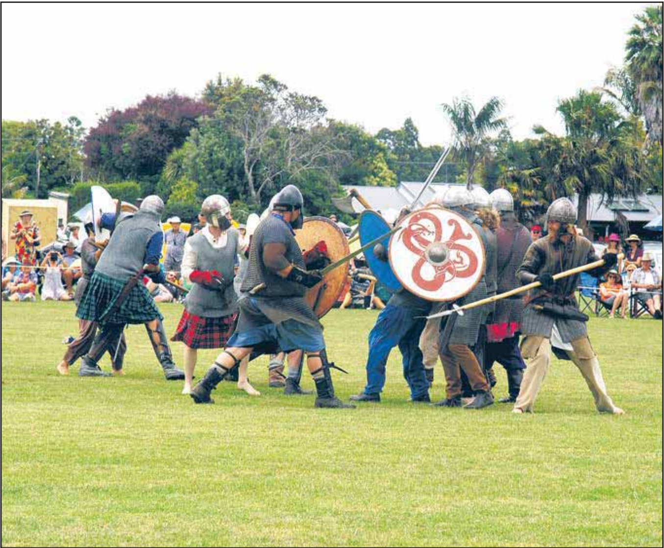
The Scots and the Norsemen battled it out on the centre field during the lunch break.