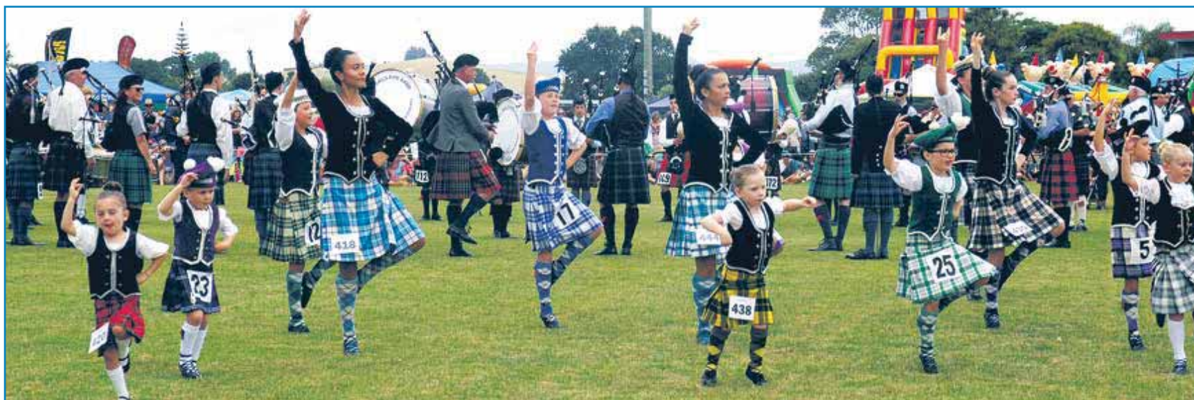
Highland dancers of all ages came together for a massed fling on the centre field.