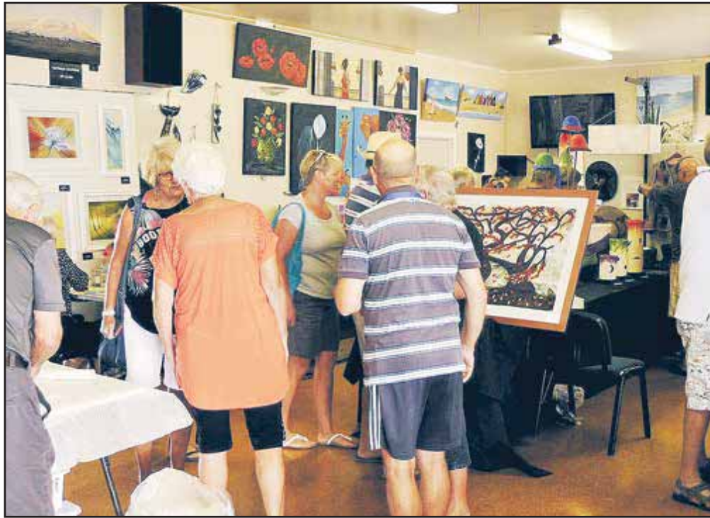
At last year's exhibition

The event will be held on the Saturday and Sunday