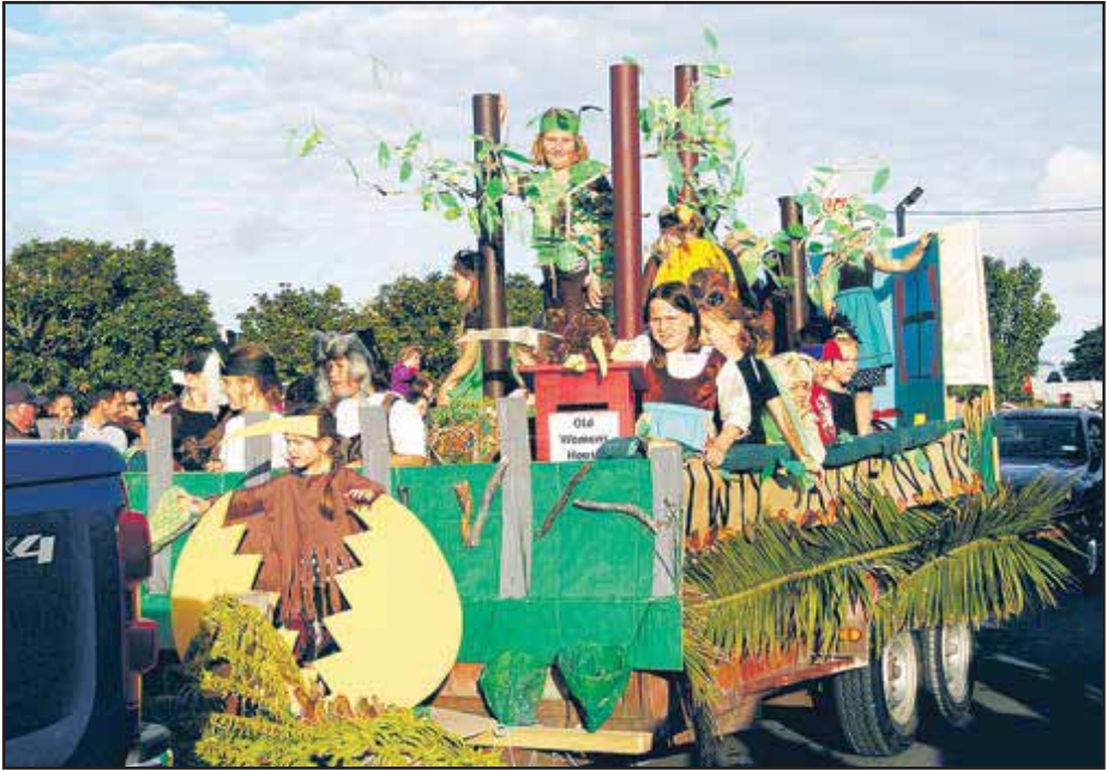
Above: Waipu Primary School won a $200 prize for this entry

A $2,000 prize pool was handed out at the Waipu Christmas Eve Parade with the Waipu Surf Lifesaving Club taking the major $1,000 prize with a vast collection of storm troopers, jedis and other Star Wars characters riding or striding down the street. Other $200 prizes were won by the Northpine Float for the Best Business Entry, the Cardio Drunning Float for the Best First Time Entry and the Waipu Play Centre and Waipu Primary took runner up awards. Waipu's Circool Circus won the best community group entry prize. A large crowd turned out to watch the parade as it made its way down the street and into the Caledonian Park for a pipe band recital and prize giving.