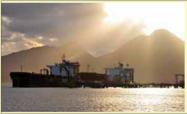
The coastal tanker Kakariki loading refined oil products on Jetty 2 at the Marsden Point Oil refinery.