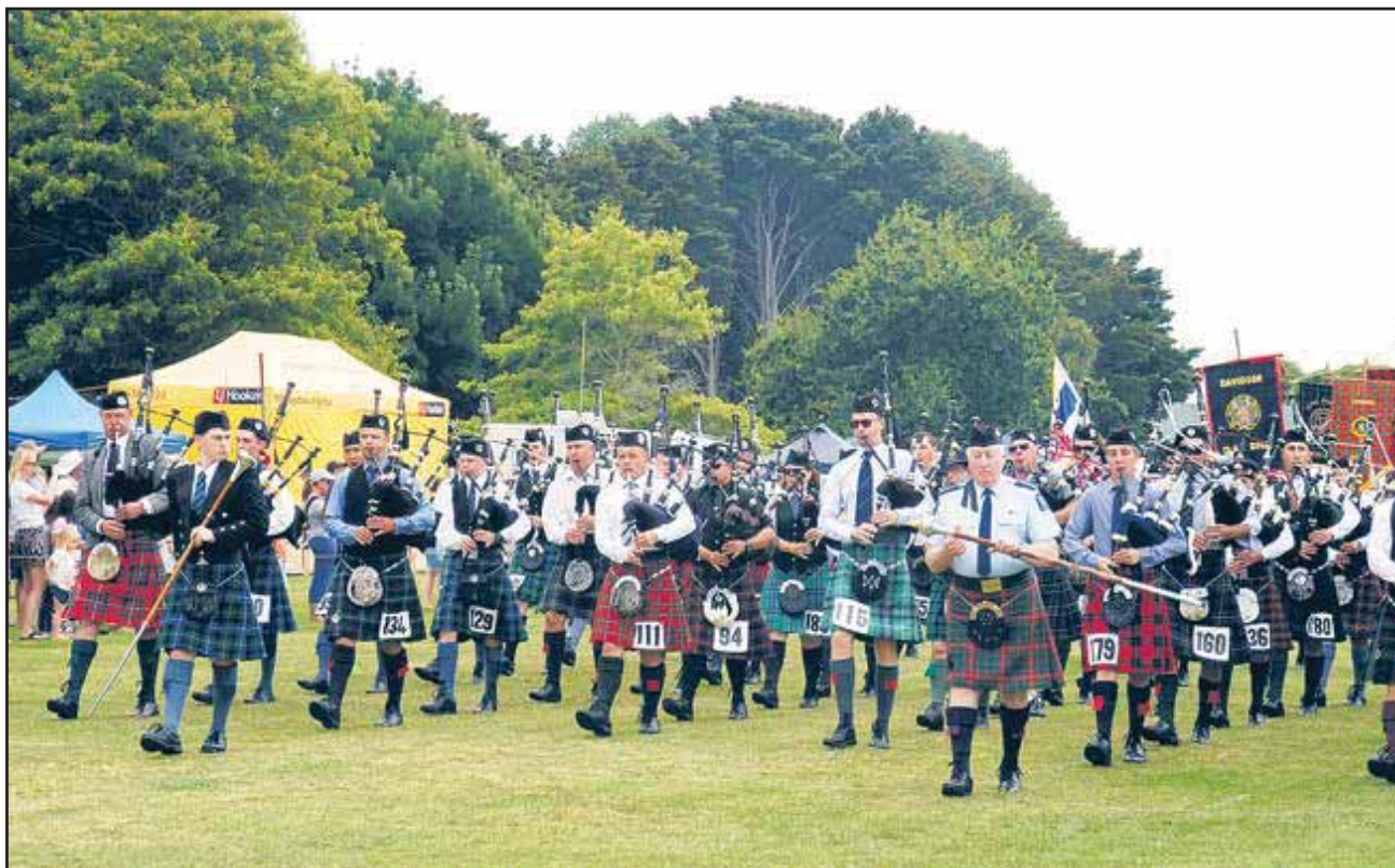
The massed pipe band marches into the arena at the 2018 Waipu Highland Games.