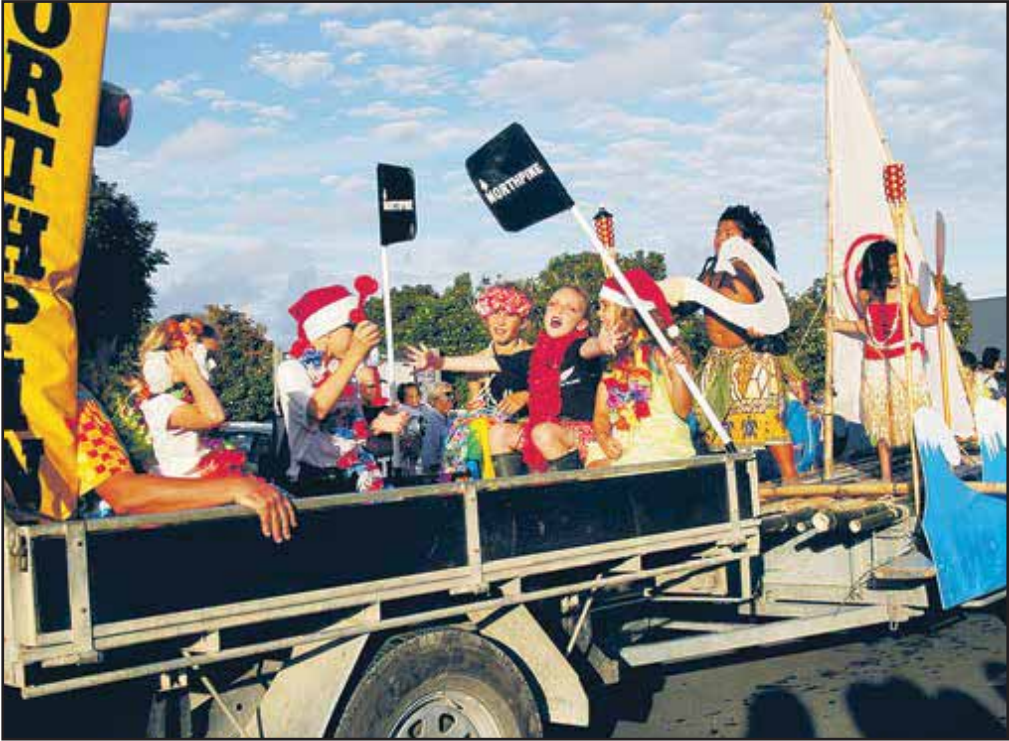
The Waipu Rugby Club float was based on the Disney film Moana