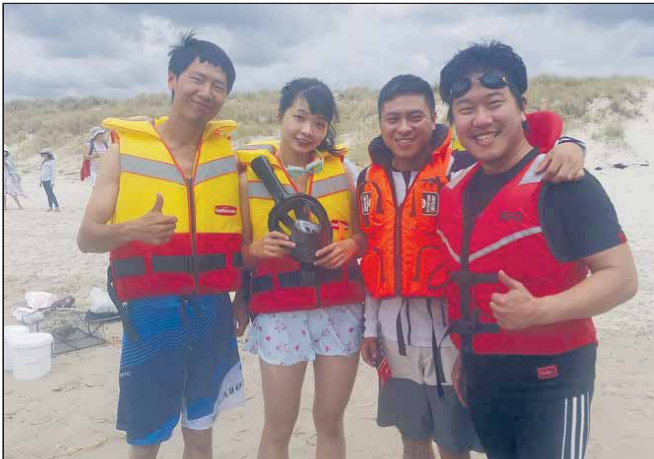
Many crab fishers are now wearing life jackets.