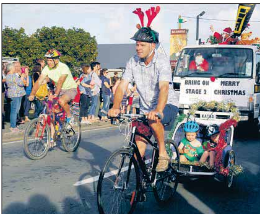
People of all ages wearing Christmas decorations and riding bikes made up the Waipu Cycle and Walkway supporters entry to the Waipu Christmas Parade

Fundraising for the project continues with trail supporters selling tickets to another big raffle. First