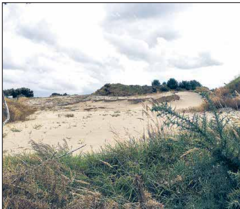
Excavated land on the 80 lot subdivision development to the south of Dune Lake Place and Sea Dune Place