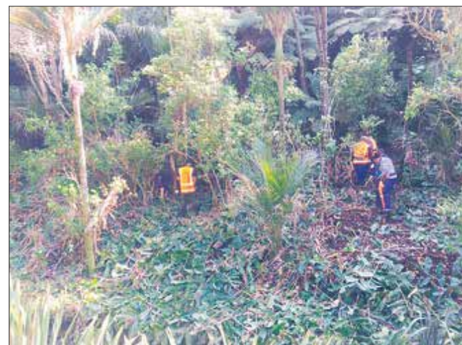
Attacking wild ginger at the western end of Langs Beach