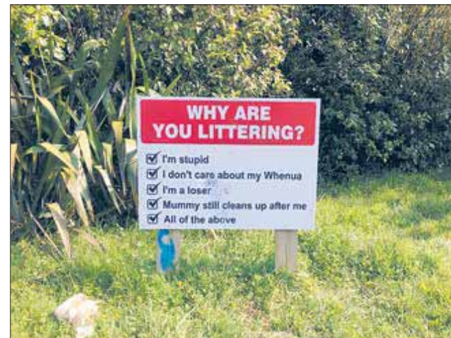
A sign at the summit of the road over Mangamuka mountain.

When I go for a walk I would rather be watching the waves on the beach, the birds and the trees, thinking about some wonderful book I am reading, a conversation I have had with a friend or an interview with some interesting person I have heard on the radio then be feeling all this annoyance at these lazy, stupid people who think the world exists for them to thrash. Still we can't leave all that stuff there. It spoils the view and the plastic will end up in the sea. My personal undertaking is to clean up the rest area on State Highway One at Uretiti before Labour weekend. This morning as I drove back from the beach, I noticed seagulls having a feast on a half eaten pack of fish and chips left there. There is also a heap of aluminum cans just off the highway in Mountfield Rd. It looks like