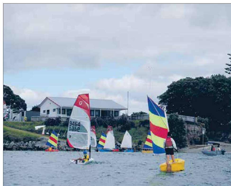
Colourful scene in front of the Marsden Yacht and Boat Club

Club racing takes place generally on the afternoon of the training days so