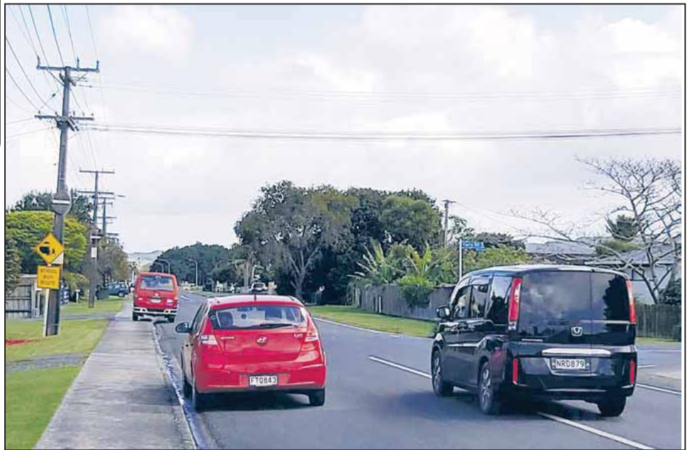
Shoemaker Rd. too narrow to be a SH1 interchange

Thank you for your article regarding the proposed roading changes in Waipu. It did surprise me to read that Waka Kotahi are even considering turning Shoemaker Road from a quiet narrow road residential street, into a SH1 interchange and channel all the logging and large trucks down this road. Shoemaker is filled with housing, with families and kids on bikes etc. I have added a couple of photos demonstrating how narrow it is, with some vehicle's half parked on