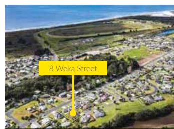
8 Weka Street, Ruakaka