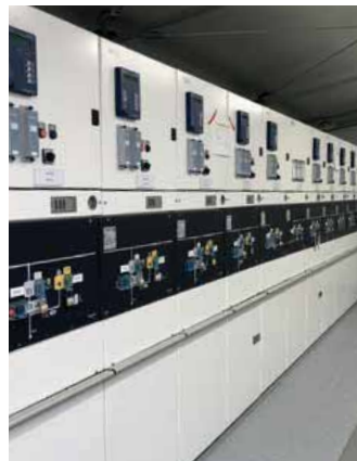
Left: Old switchboard installed in the 1960's. Right: The new switchboard.