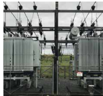
Old transformers from the 1950s and 1970s, supporting up to 2500 homes and businesses. On the right - New 10MVA transformers, capable of supporting up to 5000 homes and businesses.

This project will cost $4.8 million and has taken 12 months. The new transformer arrived on site last week and it will be lived in by the end of October.