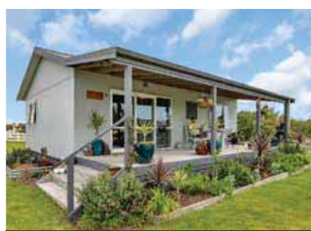
21 Dune Lake Place, Ruakaka