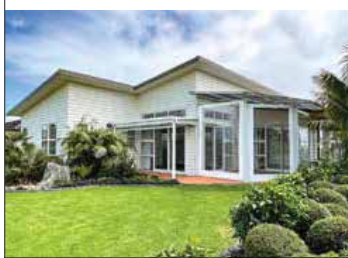
21 Barbados Way, One Tree Point