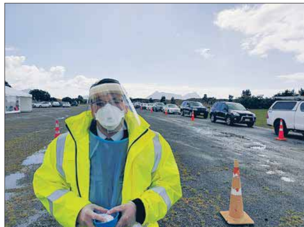
Dr. Shane Reti giving vaccines at the Ruakākā Racecourse

Kia Ora Ngatiwai runs a clinic for testing and vaccinations at the Bream Bay Trust Centre every Wednesday morning from 10am to 12 noon.