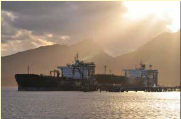
The coastal tanker Kakariki loading refined oil products on Jetty 2 at the Marsden Point Oil refinery.