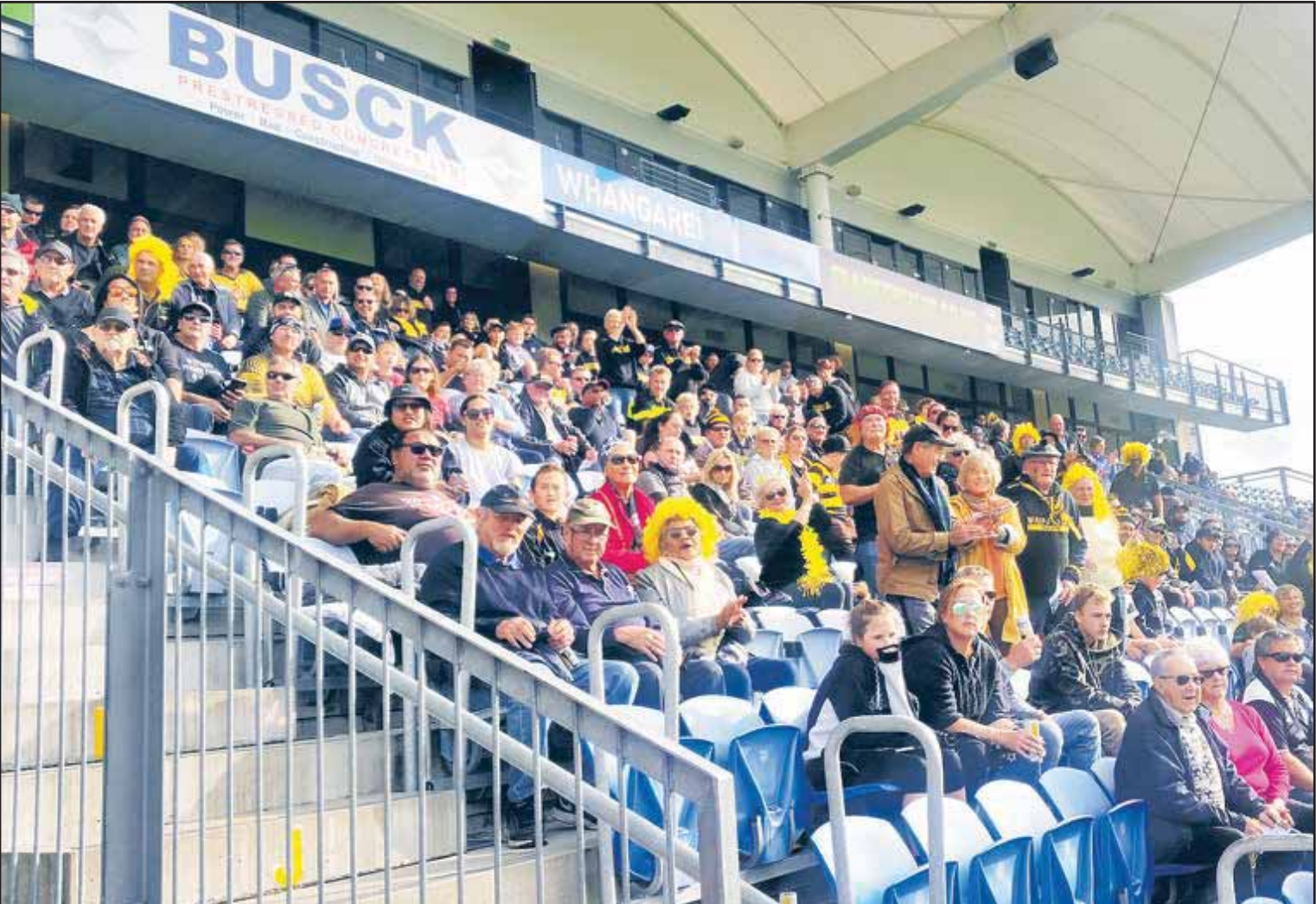
Waipu Rugby’s yellow and black colours were in strong evidence at Toll Stadium on Saturday afternoon for the club’s senior premier team’s game against Kamo in the Northland Bayleys Premiership final on Saturday afternoon 21 July.