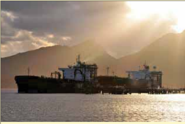
The coastal tanker Kakariki loading refined oil products on Jetty 2 at the Marsden Point Oil refinery.