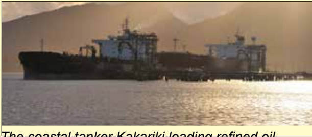
The coastal tanker Kakariki loading refined oil products on Jetty 2 at the Marsden Point Oil refinery.