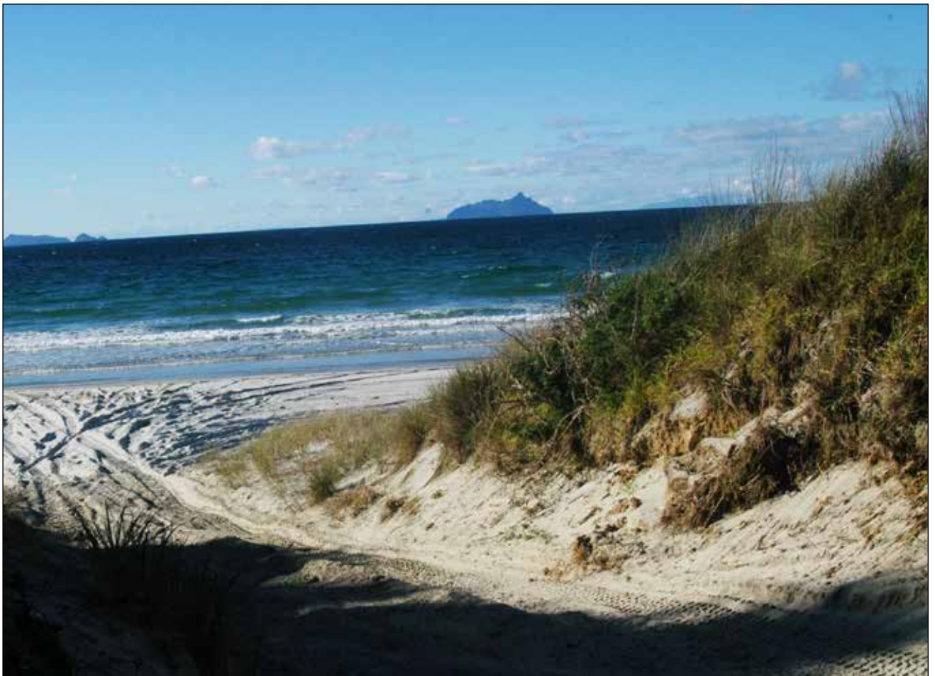
Fences cut and taken down and an illegal vehicle beach entrance formed