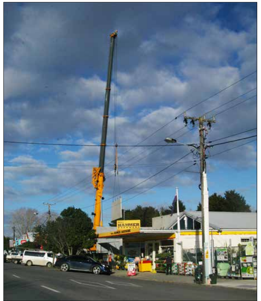
A100 tonne crane lifts a wall into place in the new Café Deli and Harkers Herbal outlet currently under construction in The Centre, Waipu. The new tilt slab retail building replaces one of two destroyed by fire on 30 September 2018. Work is expected to begin on a new Waipu pharmacy building this month.

The maximum penalty for making objectionable publications is 14 years imprisonment and the maximum penalty for having an objectionable publication in your possession is 10 years imprisonment or a fine of $50,000.