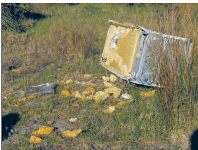
A discarded fridge freezer