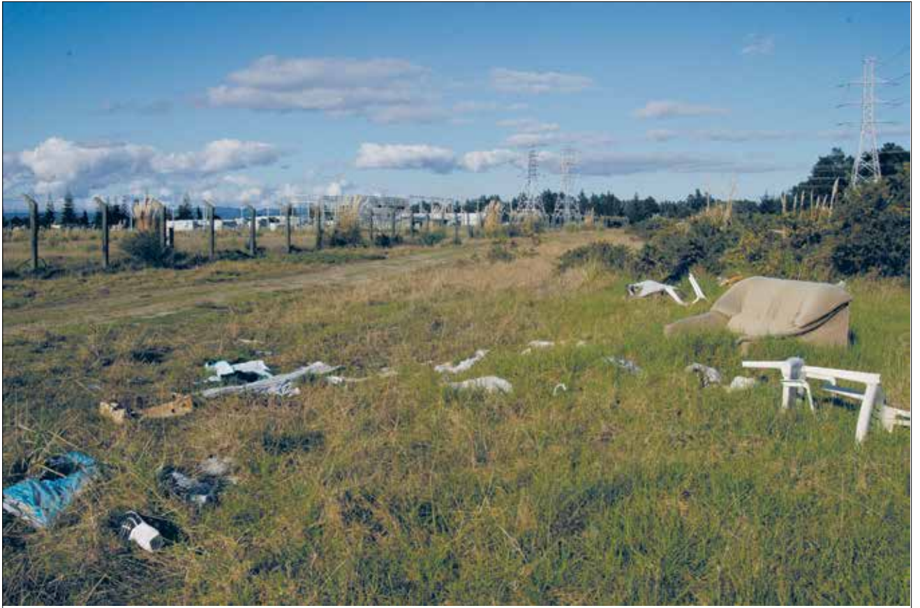
Household rubbish dumped and strewn about