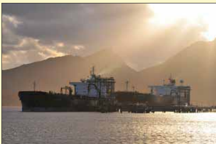
The coastal tanker Kakariki loading refined oil products on Jetty 2 at the Marsden Point Oil refinery.