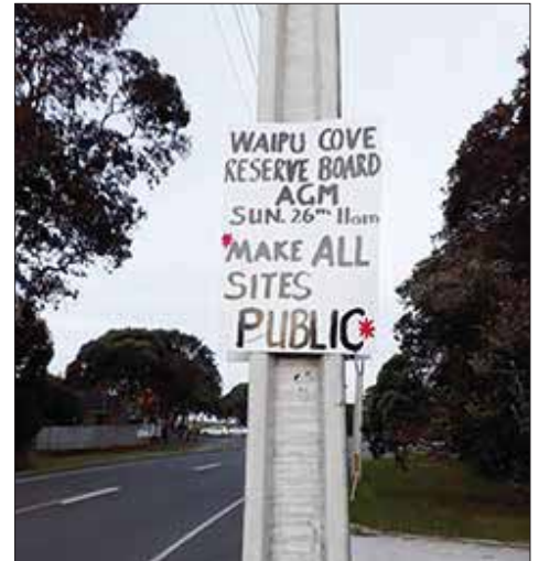
Angus McCulloch put up this sign to alert people to the continued practice of annual site holdings at Camp Waipu Cove

The fees paid by annual site holders were used to demonstrate the camp had a quarantined income when it applied for loans to build camp facilities such as new kitchen, laundry and toilet blocks. The construction of cabins (the camp now has 12