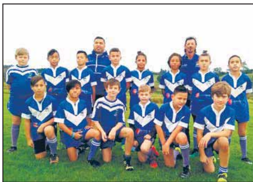
The Takahiwai Under 11 Rugby League team

They have run sausage sizzles at North Port and