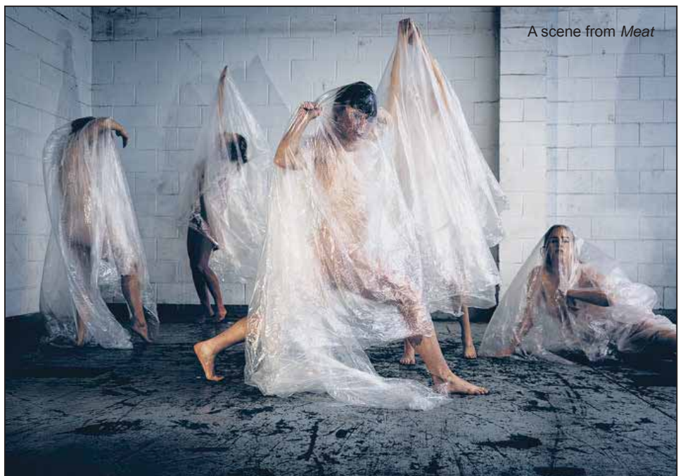
A scene from Meat

Also right through its making she said the participants had some good conversations around their divergent views and consumer habits.