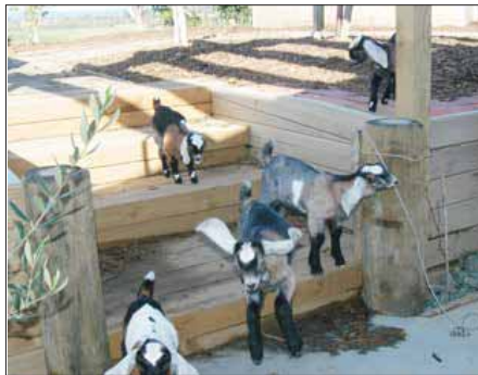
Full of the joys a=of spring: some of the the babies at Belle Chevre.