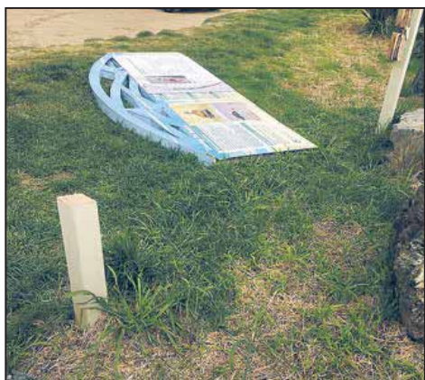
The vandalised shorebird sign at Tip Rd.

The shore bird-breeding season has begun and prospects for birds attempting to nest on the northern edge of the Waipu Wild Life Refuge do not look good.