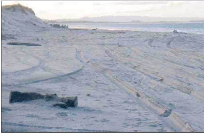
Dotterel looking for a breeding site amongst the tyre prints at the Waipu Estuary.

chance of fledging chicks with vehicles and dogs in the wild life refuge.”