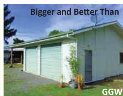
Bigger and Better Than

He said the area inland of Waipu is hilly and has a lot of bush and there are often pig hunters in the area but with visiting lifestyle blockers, spectators of the rally and pig hunters he could not be certain who was responsible for the dogs.