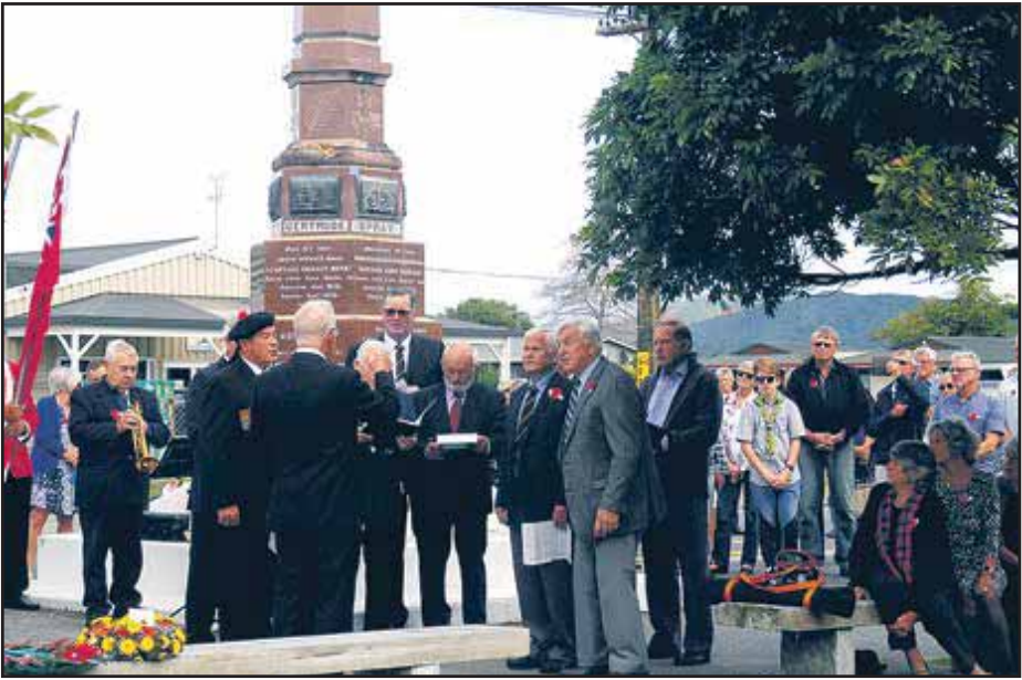
The Waipu Men's Choir