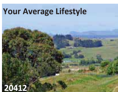
Your Average Lifestyle