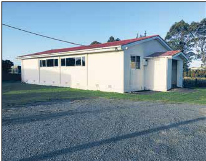
The Braemar Lane Hall was paid for and built by the Waipu Community.