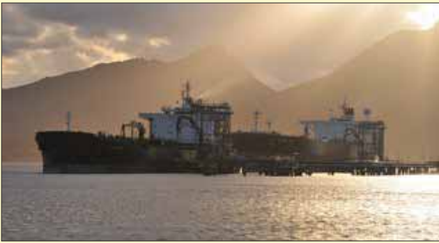
The coastal tanker Kakariki loading refined oil products on Jetty 2 at the Marsden Point Oil refinery.