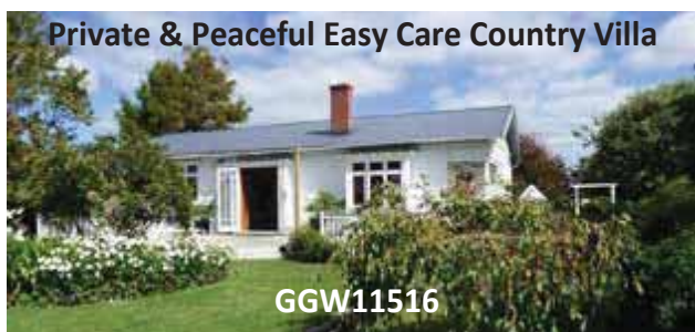
Private & Peaceful Easy Care Country Villa