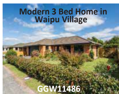
Modern 3 Bed Home in Waipu Village