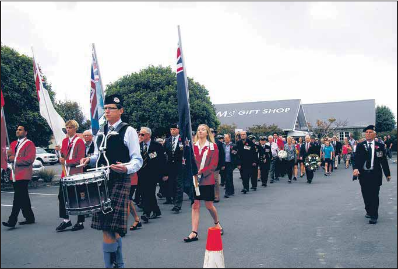
The parade arriving in the carpark alongside the Waipu cenotaph.