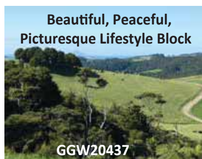
Beautiful, Peaceful, Picturesque Lifestyle Block